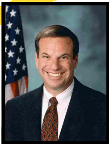
Congressman Bob Filner