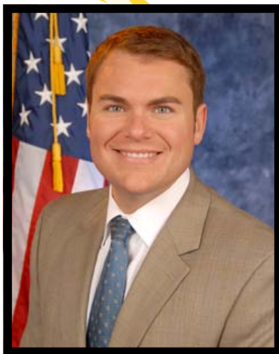
Councilmember Carl DeMaio